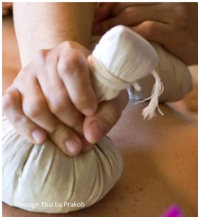
Massage Thai Lu Prakob