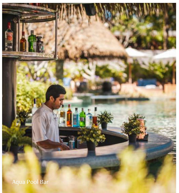
Aqua Pool Bar