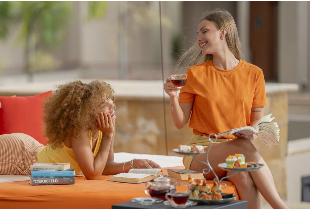
▲ Avani Ao Nang Krabi_Book Club_Afternoon Tea

A global reading initiative bringing together #BookTok-era discovery, local voices and destination-led experiences across the Avani portfolio