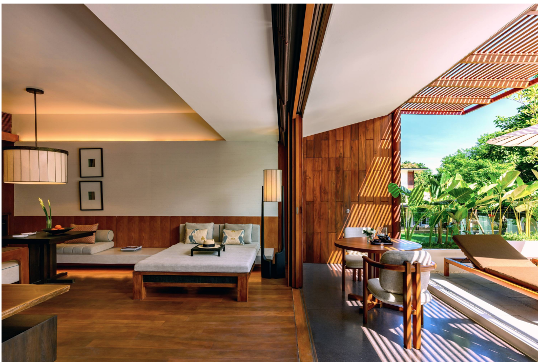
▲ Anantara Chiang Mai Resort

Set along the banks of the Mae Ping River, Anantara Chiang Mai Resort invites guests to uncover the timeless charm of the former Lanna Kingdom through elegant riverside living, exceptional gastronomy, and immersive local experiences. The journey then continues north to Anantara Golden Triangle Elephant Camp & Resort, perched above the borders of Thailand, Laos and Myanmar, where travellers can embrace extraordinary adventures in one of Southeast Asia's most fascinating landscapes.