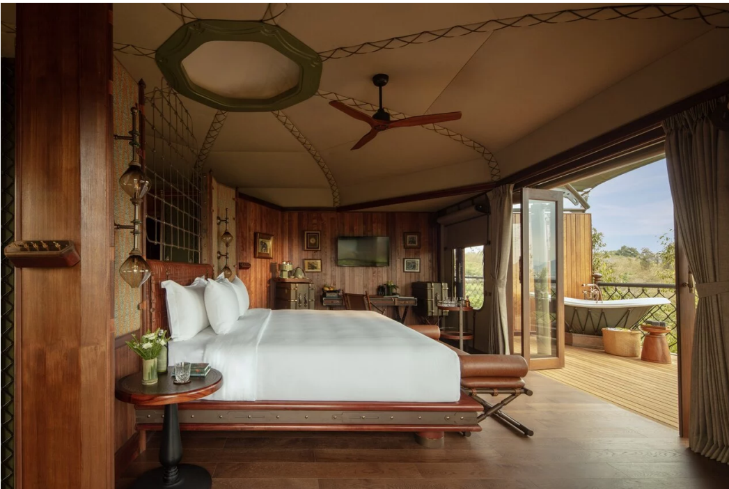
▲ Anantara Golden Triangle Elephant Camp & Resort

Experience the cultural elegance of Chiang Mai and the untamed beauty of Northern Thailand's legendary Golden Triangle in one seamless luxury escape.