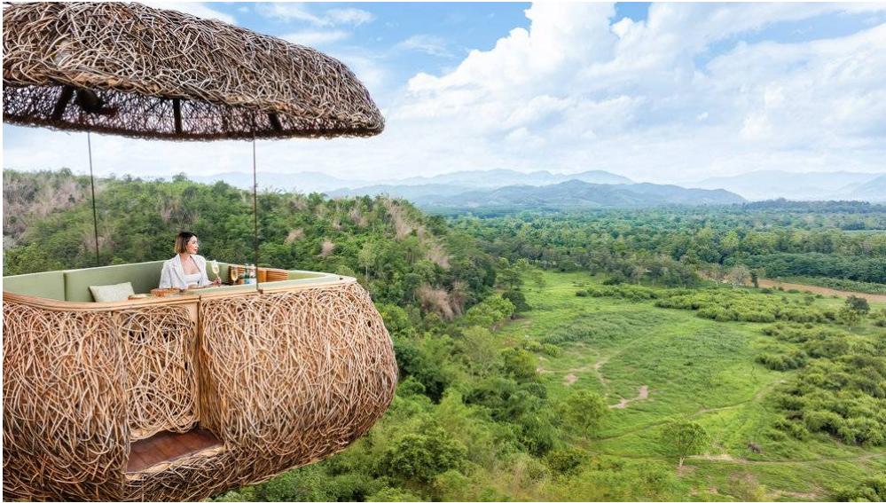
▲ Canopy, A Tree Top Dining Experience, at Anantara Golden Triangle Elephant Camp & Resort

A naturalist's playground surrounded by Northern Thailand's lush jungle, Anantara Golden Triangle Elephant Camp & Resort proudly unveils Canopy, A Tree Top Dining Experience , an innovative dining concept that speaks to the resort's eco-conscious ethos and its commitment to promoting authentic regional flavours.