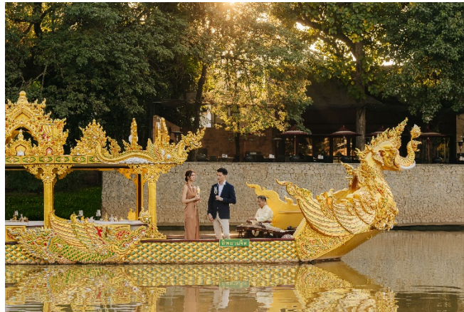
Dibba Yana Chitta

Located right on the banks of the river, and with a private pier, Anantara Chiang Mai is the starting off point for wondrous cruises through the city. Guests can journey in style aboard three types of boats; Nam Jai , the teak scorpion-tail barge, which drifts under iconic bridges, past small temples and into lush green. Or the Nam Jit , the resort's teak rice barge, which sails along the Mae Ping River, passing some of the city's most iconic bridges, small temples, and lush greenery. The latest addition to JAO Ping River Cruise fleet is Dibba Yana Chitta , a floating masterpiece designed by a renowned Thailand's national artist, Chalermchai Kositpipat.