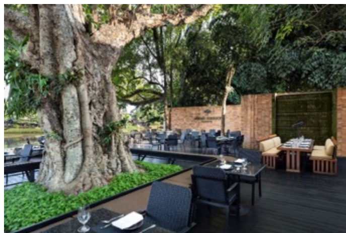
Bodhi Terrace North to South Thai

Anantara Chiang Mai's restaurants present flavours from around the world in a stunning riverfront setting. Guests can enjoy innovative chef creations in the former British consulate, afternoon tea on the verandah, and sparkling cocktails overlooking the sunset.