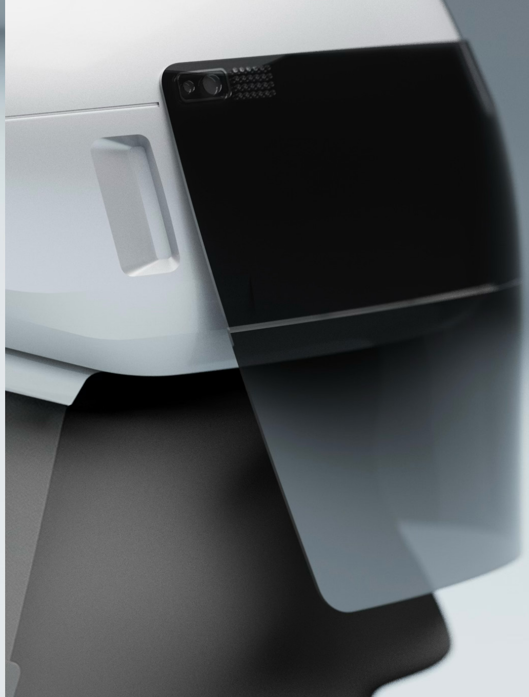
STINGR SMART HELMET CONCEPT / JUNE 2026