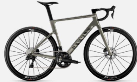
Endurace CF SLX / P02 / Champagne