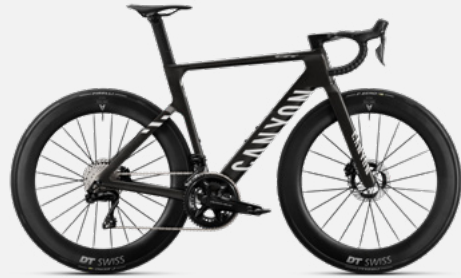
Endurace CFR / P01 / Pro Black