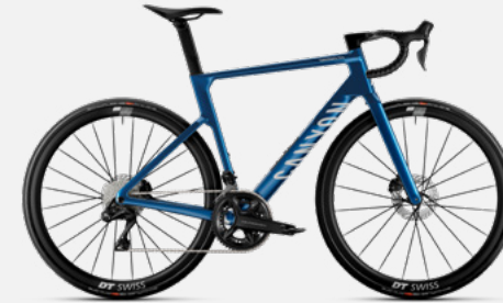
Endurace CF SLX / P03 / Atlantic Blue