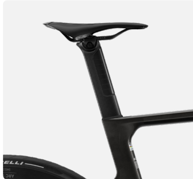
SP0093 VCLS AERO: WORLD FIRST

25% less force is required for deflection on SP0093 VCLS Aero which translates to a more compliant, smoother ride.