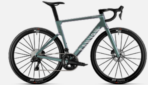
Endurace CF SLX / Colorflow