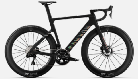
Endurace CFR / P03 / Dark Matter