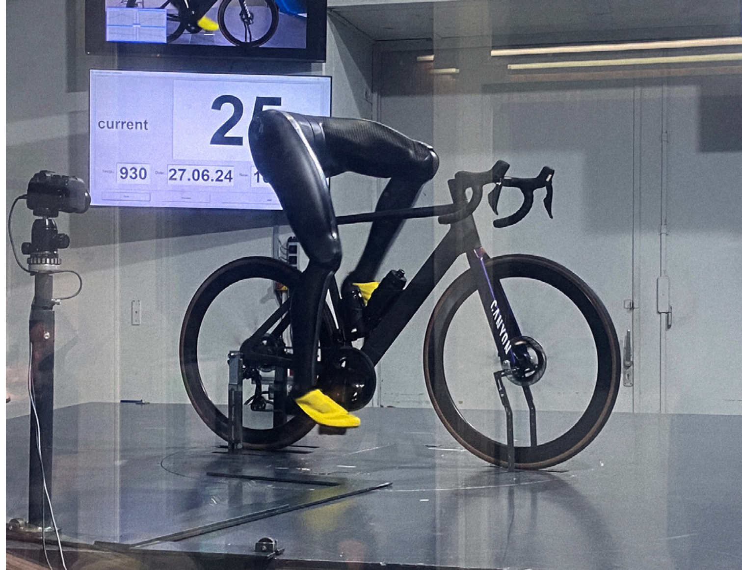
*TEST SETUP: "FERDI" MOBILE LEG DUMMY / 2 X 600 ML BOTTLES PLUS CAGES / DT SWISS ARC 1100 65 WHEELS / CONTINENTAL AERO 111 29 MM FRONT TYRE / 5000 S TR 30 MM REAR TYRE

The Endurance CF SLX follows the same aero concept as the Endurance CFR, with the higher stack accounting for a 4 W difference. These gains represent over 10 W improvement over the previous Endurance CF SLX and put it on a level faster than bikes regularly raced in the WorldTour.