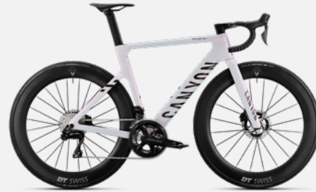
Endurace CFR / P02 / Paradigm Shift