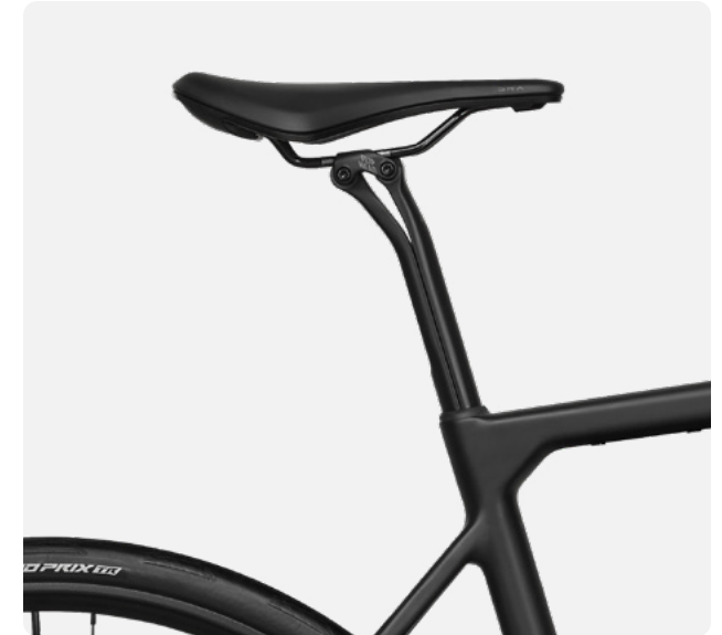
SP0100 VCLS 2.0: EVOLUTION OF AN ICON

A smoother ride with no compromises in aero performance, SP0093 VCLS Aero is a world first on Endurance.