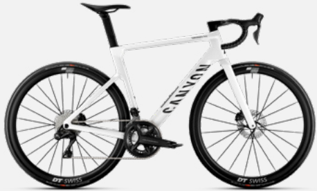
Endurace CF SLX / P01 / Crystal White