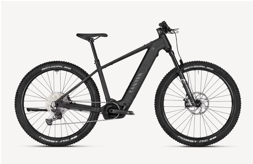
MODEL Grand Canyon:ON AL 8 COLOR P01 (Stealth Black) P02 (Glacier)