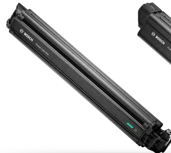
Bosch PowerTube 600 Wh Battery