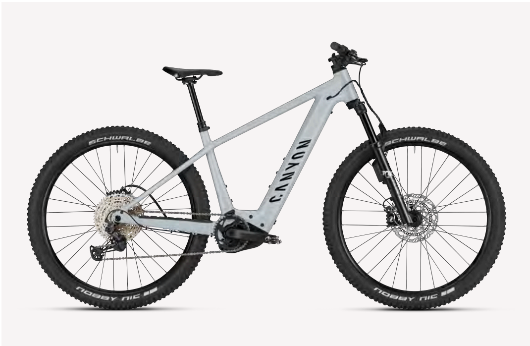
MODEL Grand Canyon:ON AL 9 COLOR P05 (Eis am Stiel)