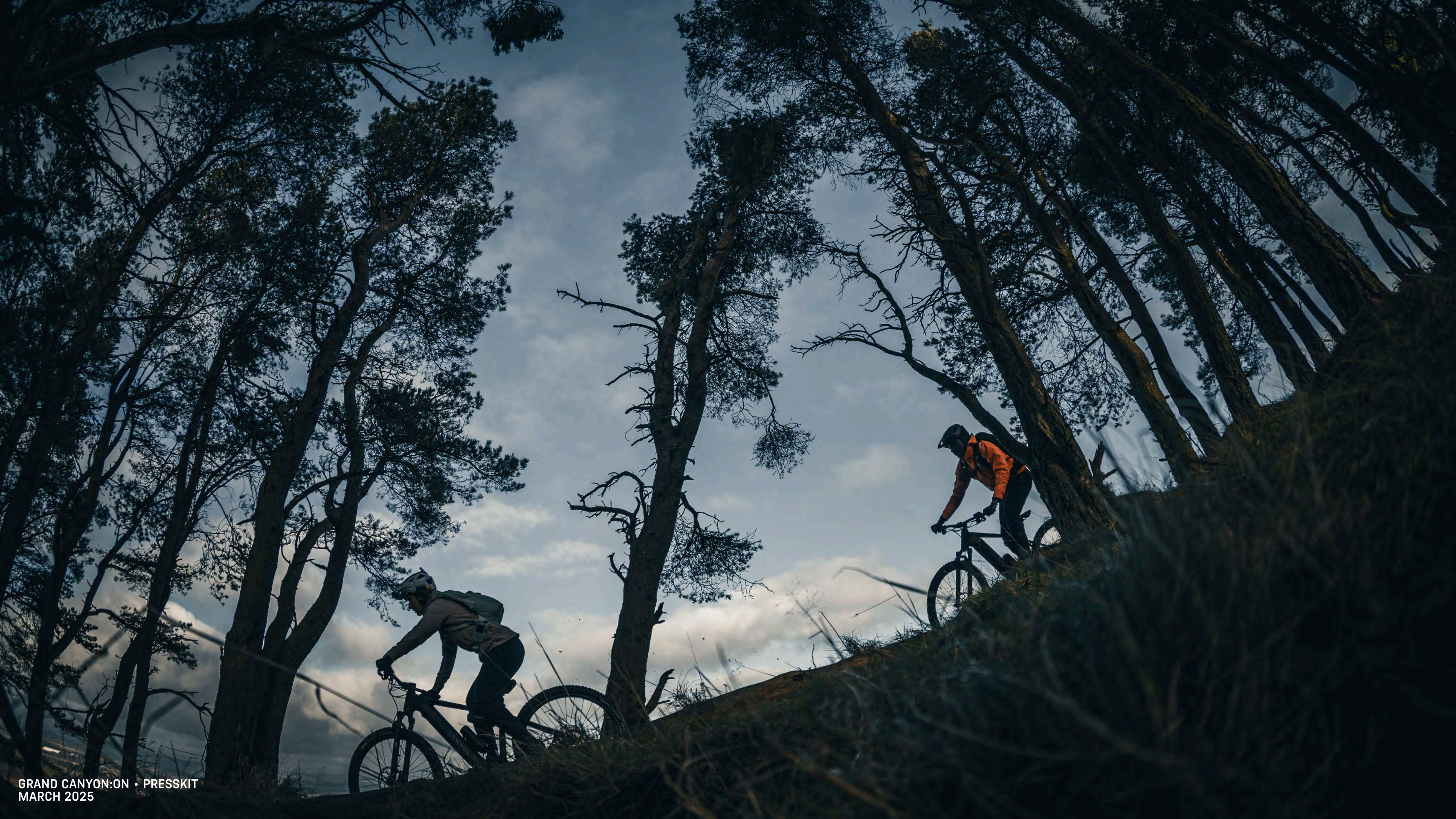
GRAND CANYON:ON • PRESSKIT MARCH 2025