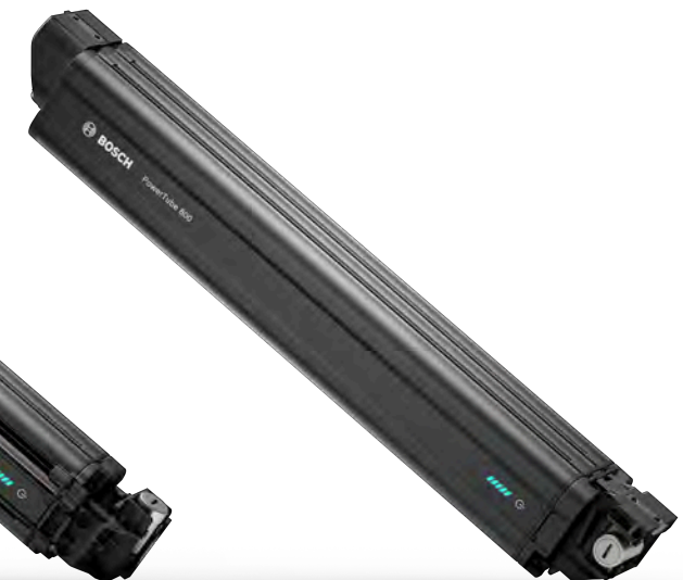
Bosch PowerTube 800 Wh Battery