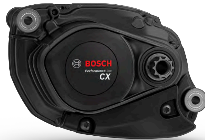
Bosch Performance Line CX Motor

No hill is too steep, no trail is too long. Bosch's 5th generation CX motor is the smooth, quiet, dependable heart of the Grand Canyon:ON; providing up to 85nm of trail taming, hill flattening, headwind crushing, cargo hauling torque, and 600w of peak power. Four ride modes are easily accessible through the Purion display, allowing riders to tailor the available levels of boost. And with either of the integrated, removable 600wh or 800wh batteries, there is enough range to power even the most ambitious adventure for hours on end. Strap the optional 250wh range extender into place, and with up to 1050wh of juice on tap reset all ideas of what might be possible.