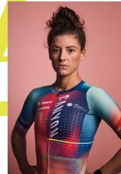
CHLOÉ DYGERT 27, USA

has consistently demonstrated her talent as a cyclist, being ever-present and aggressive in races. In 2023, she added a second GC podium at the Tour de France Femmes avec Zwift and won the mountain classification.