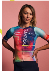
KASIA NIEWIADOMA 29, POLAND

Ride to advance. Race to inspire. BREAK AWAY TO CHALLENGE.