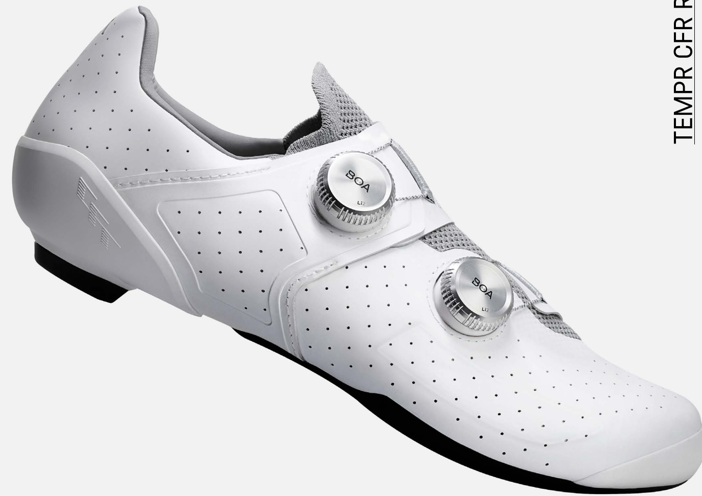
TEMPR CFR ROAD

Our pro-level road shoe is stiff where you need it, and soft where you want it. Achieving a perfect mix between speed and comfort, so you can power your fastest rides for longer.