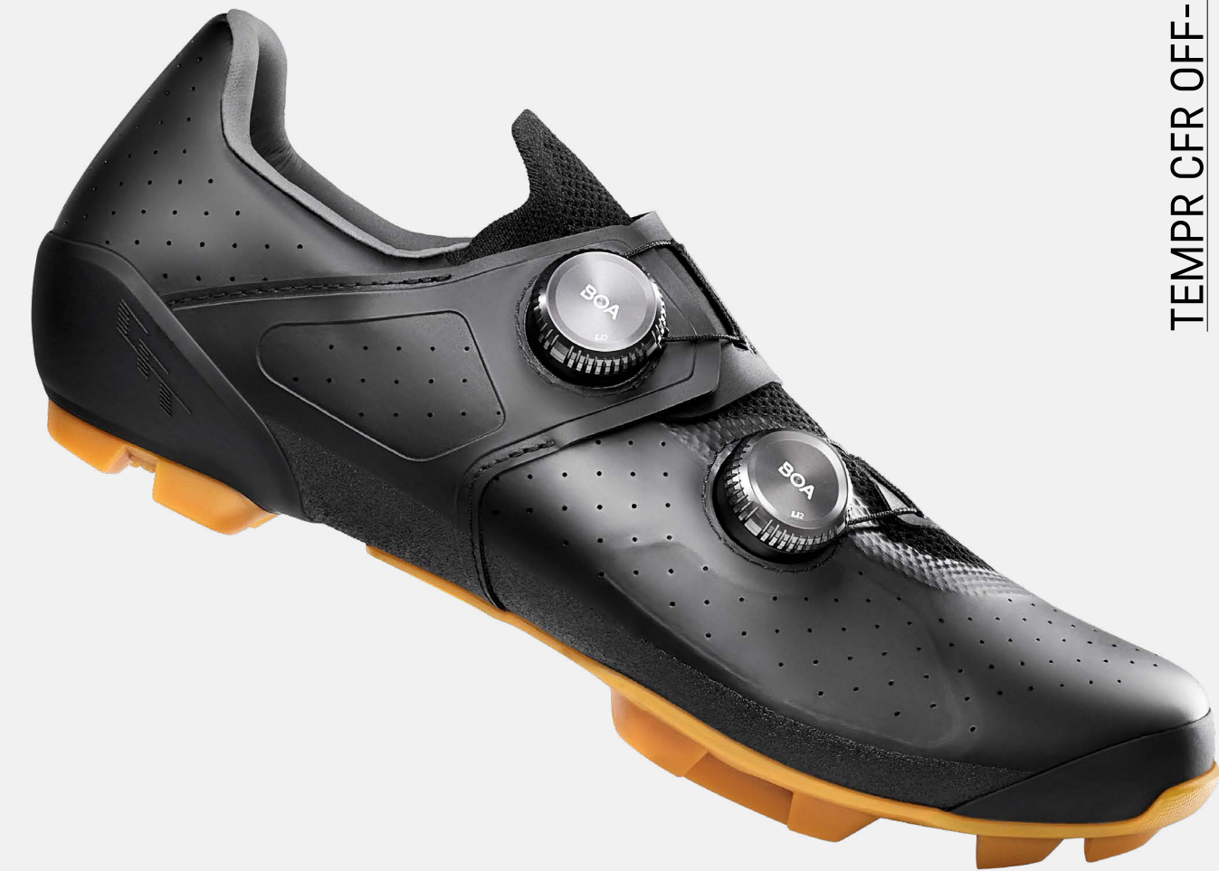
TEMPR CFR OFF-ROAD

Our pro-level road shoe is stiff where you need it, and soft where you want it. Achieving a perfect mix between speed and comfort, so you can power your fastest rides for longer.