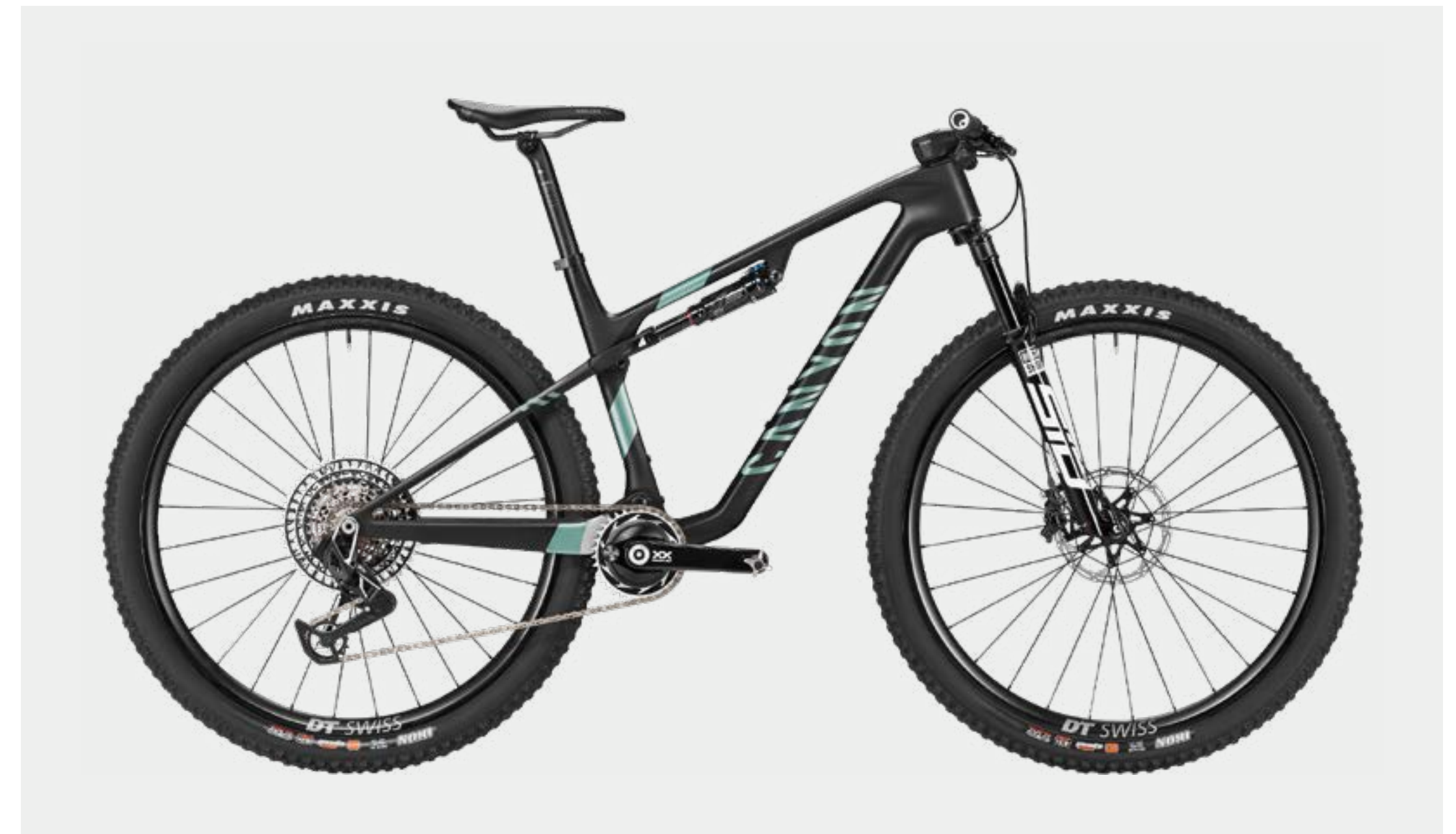
LUX WORLD CUP CFR LTD • CFR GREEN