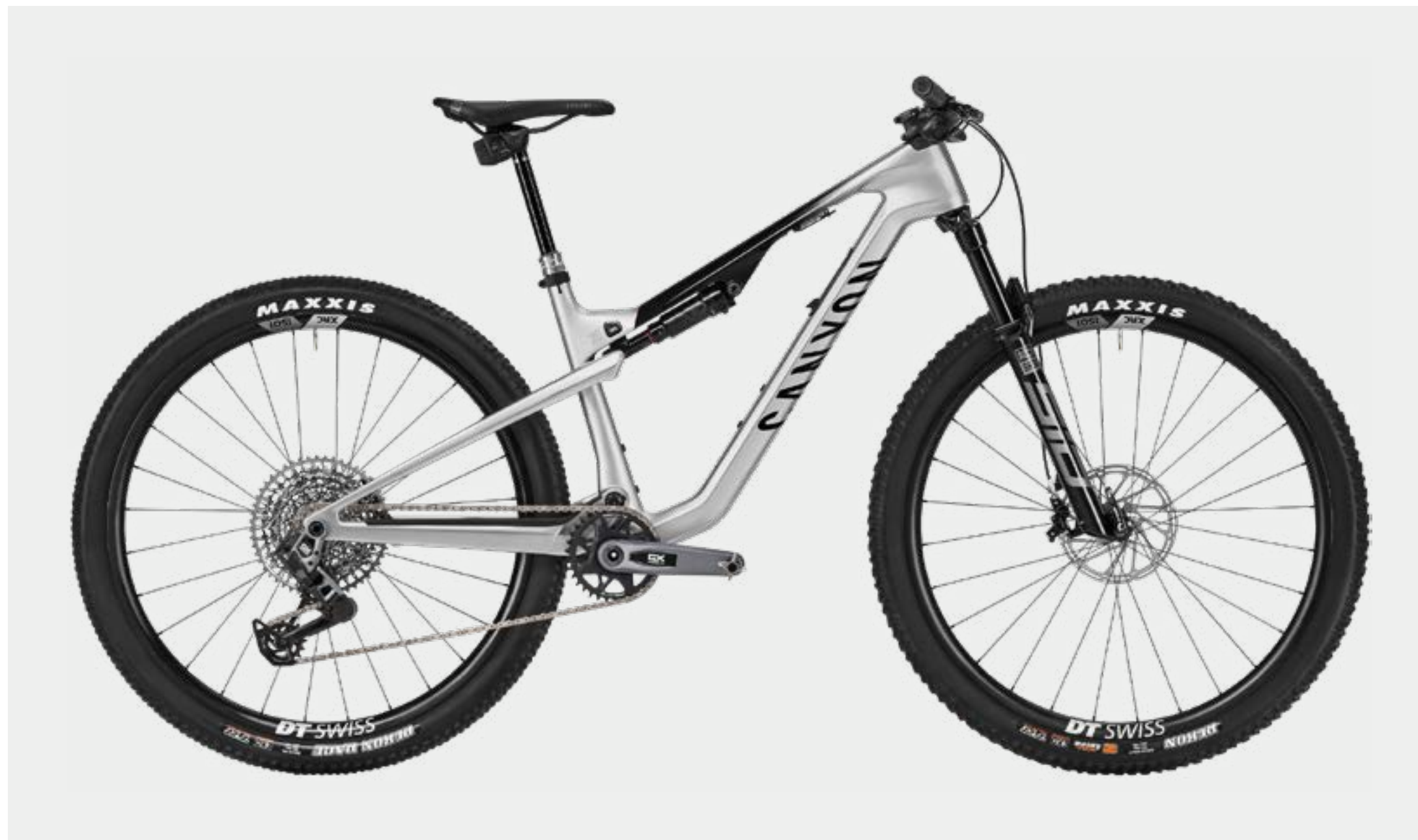
LUX TRAIL CF 9 • CHROME LEVEL 1

The LUX TRAIL is built for speed—pure and simple ... and it all starts with its cutting-edge, carbon-fiber frame. Tipping the scales at just 2,164.2 grams/4.77 pounds, the all-new LUX TRAIL 's chassis bears zero fat. But it's more than merely lightweight. The LUX TRAIL boasts peerless pedaling efficiency, yet is rugged enough to thrive on high-speed, rugged trails.