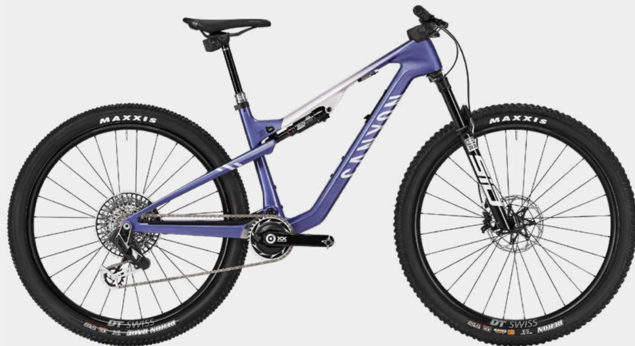
LUX TRAIL CFR LTD • LIGHTNING MAUVE

The LUX TRAIL is a completely new bike that's been entirely redesigned from the bottom up. It shares DNA with the race proven LUX WORLD CUP , but while that bike is all about chasing wins between the tape, the LUX TRAIL is made for chasing records beyond the tape.