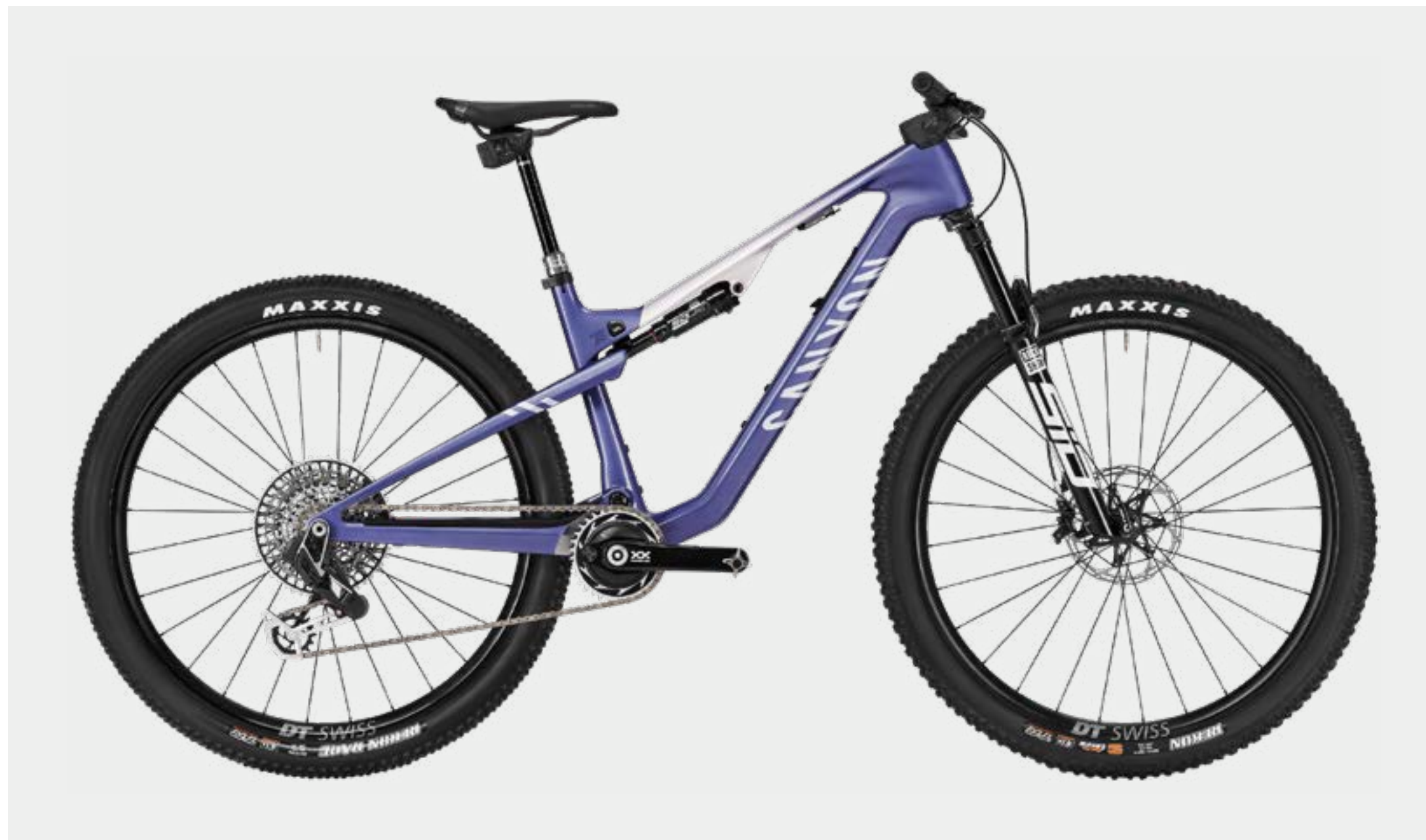
LUX TRAIL CFR LTD • LIGHTNING MAUVE

The LUX TRAIL comes from the race-proven winning DNA of the LUX WORLD CUP , except this bike has the ability to perform well beyond the tape.