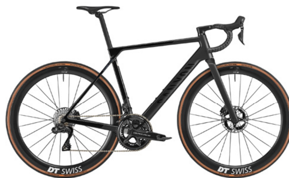
ULTIMATE CF SLX 9 DI2