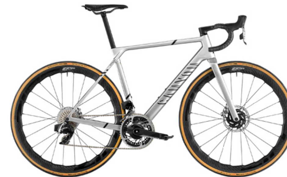
ULTIMATE CFR ETAP