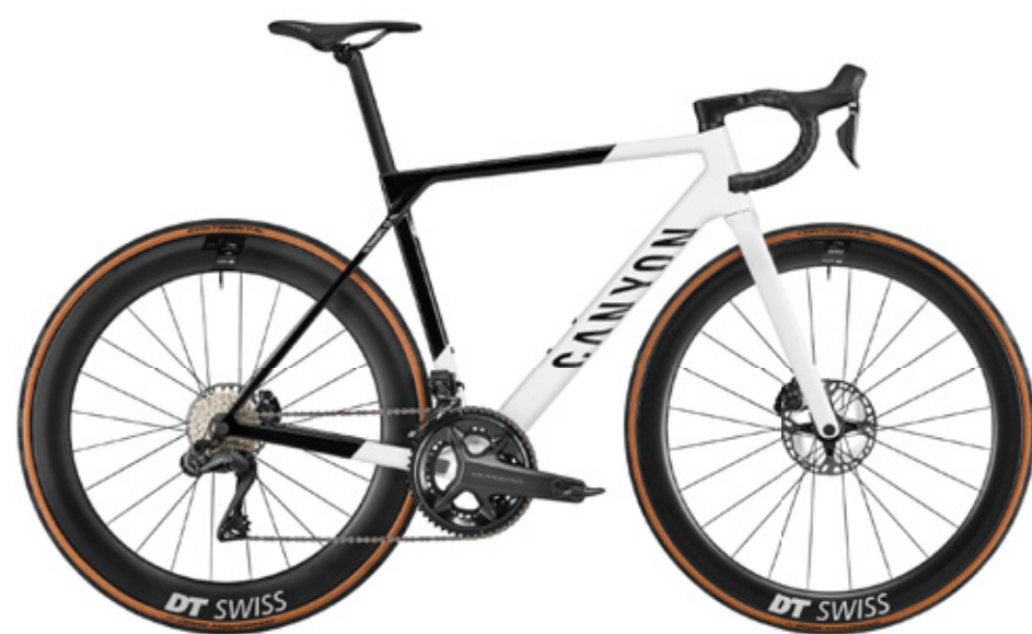
ULTIMATE CF SL 8 AERO