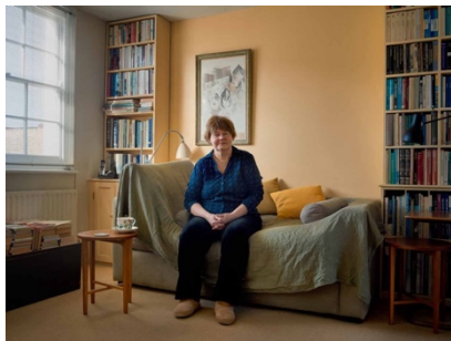
Carolyn Steel, architect, writer and author of Sitopia: How food Can Save the World (2020), London, United Kingdom 2023

PM Only to be used in combination with the portrait to which this relates.