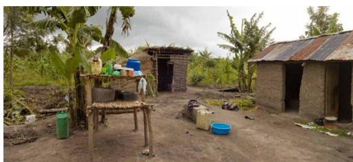
Homestead of Dinavence Ekibahirire Karubuguma, Kitagwenda District

PM Only to be used in combination with the portrait to which this relates.