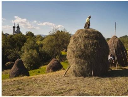
The Haystacks of Maramures, Breb, Romania © Ruud Sies

PM Only to be used in combination with the portrait to which this relates.