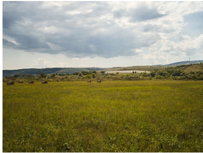
Contextual image Alina Nedelus

Tomato greenhouse Cluj Napoca