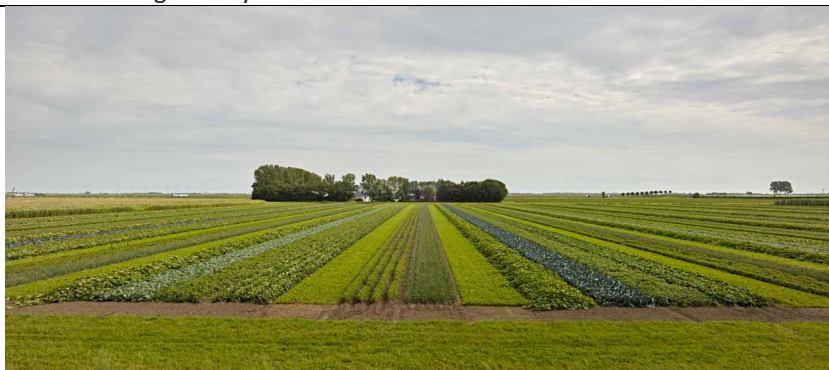
Contextual image family Mosselman

Strip cultivation on the island of Goeree-Overflakkee, the Netherlands