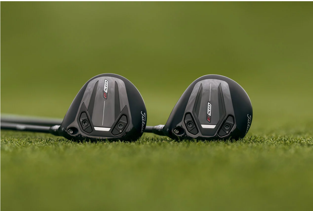
▲ NEW GTS fairways