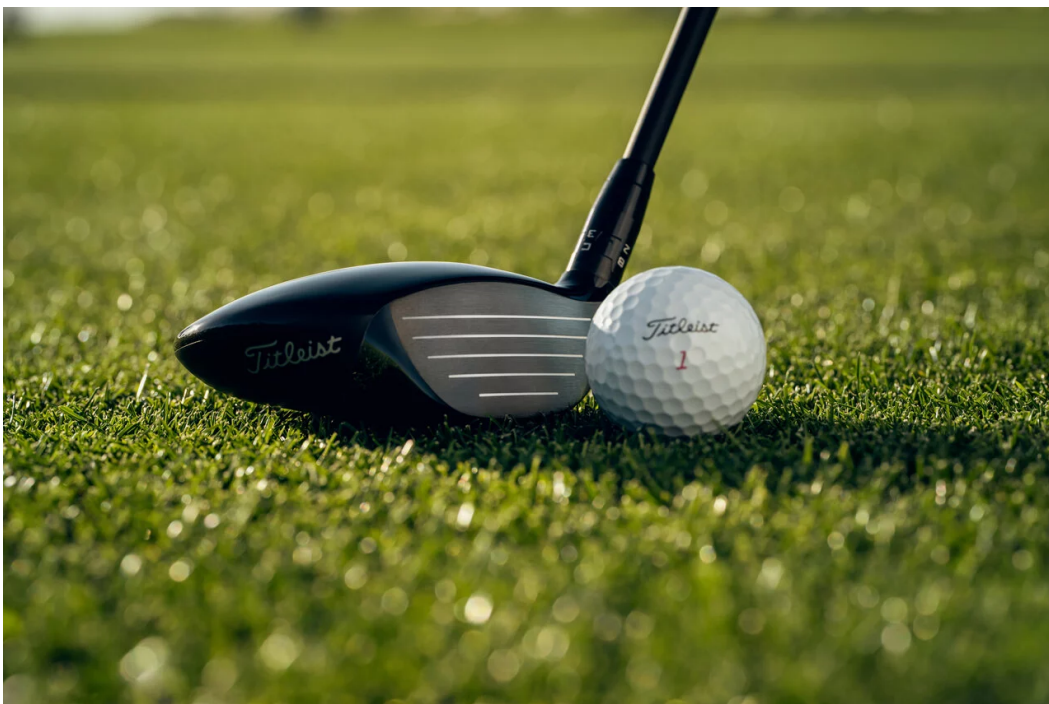
▲ Tour-inspired polished face