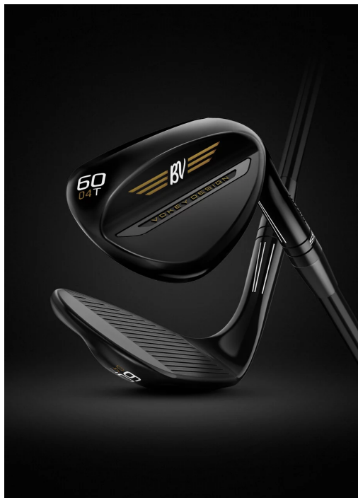
▲ Vokey Design SM11 Black Vapor with Flight Lines

CARLSBAD, Calif. (July 8, 2026) — Vokey Design introduces NEW SM11 Black Vapor wedges with Flight Lines , helping golfers unlock better wedge play by promoting repeatable, shot-specific setup positions.