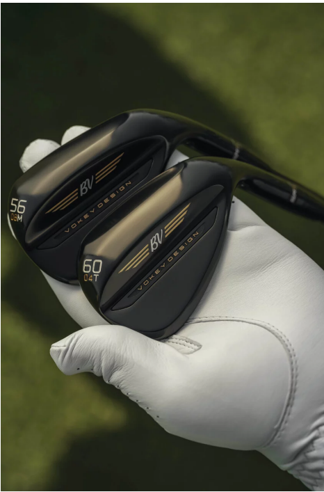
▲ Vokey Design SM11 Black Vapor with Flight Lines