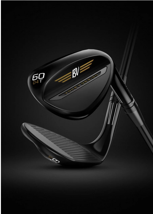
▲ Vokey Design SM11 Black Vapor with Flight Lines

CARLSBAD, Calif. (July 7, 2026) — Vokey Design introduces NEW SM11 Black Vapor wedges with Flight Lines , helping golfers unlock better wedge play by promoting repeatable, shot-specific setup positions.