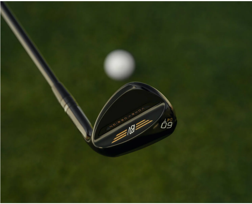
▲ Vokey Design SM11 Black Vapor with Flight Lines

© 2026 Acushnet Company. All rights reserved. Titleist and all related trademarks are the property of Acushnet Company or its subsidiaries. This announcement does not create any contractual obligations or warranties beyond those expressly provided in writing at the time of purchase.