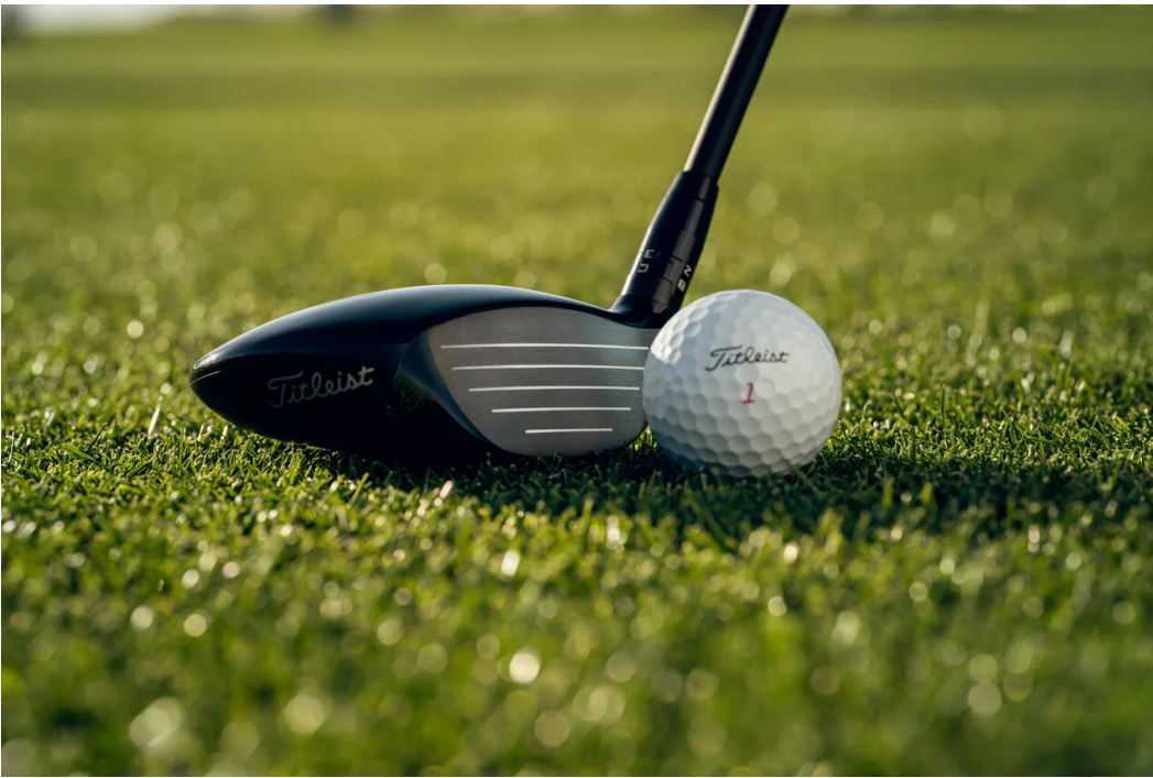
▲ GTS fairway polished face