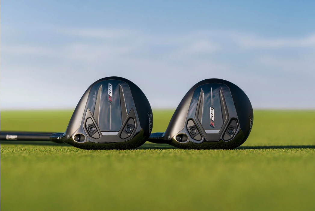
▲ NEW Titleist GTS fairways

Engineered to deliver higher flight, lower spin and increased forgiveness in two tour-proven shapes