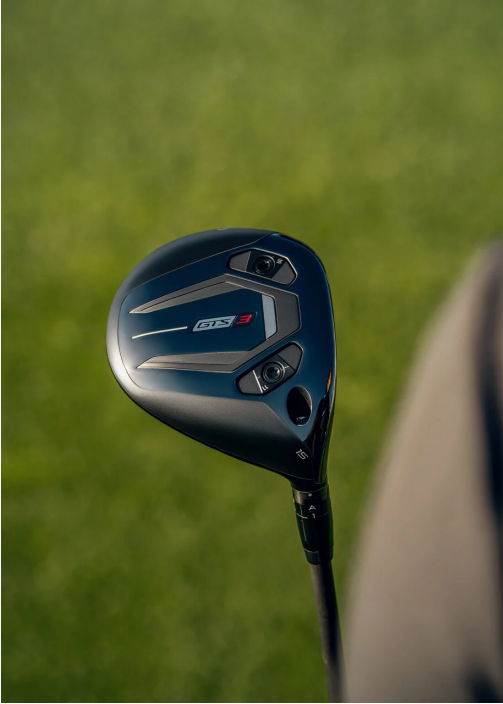
▲ NEW GTS3 fairway