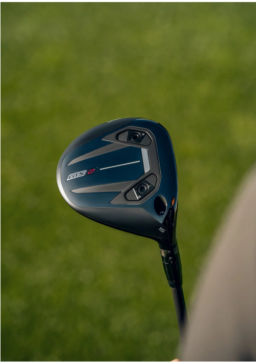
▲ NEW GTS2 fairway

The new GTS2 fairway is designed with a shallower face and a larger profile than GTS3, ideal for players with more sweeping deliveries with their fairway metals.