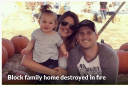
Block family home destroyed in fire

Napa, Sonoma and a number of the surrounding counties lit up last night (10/9). This morning the