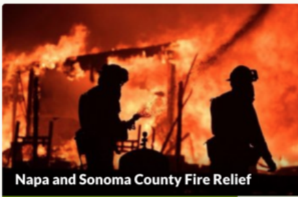
Napa and Sonoma County Fire Relief