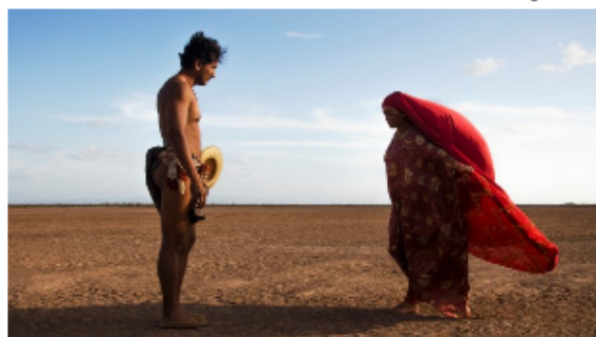
Still from Birds of Passage