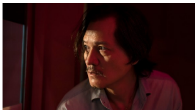
Still from A Land Imagined