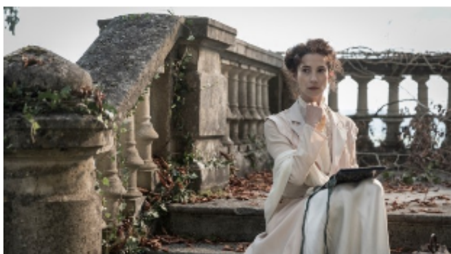
Still from The Beast in the Jungle