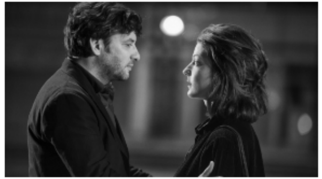
Clockwise: Asino, Lek and the Dogs, L'amant d'un jour/Lover for a Day, Readers

IFFR 2018 will be screening more films by the experienced hands of distinctive Signatures maestros. Among them is the world premiere of Asino by internationally renowned Russian theatre director Anatoly Vasiliev, a film deeply rooted in ancient mythological tales in which donkeys are observed as human beings. Another selection is the international premiere of famed experimental artist